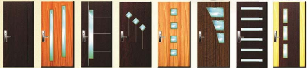
Duke Flushing Morgan Brooklyn Manhattan Queens Eastwest Modernist

Available standard sizes: 60cm, 70cm, 80cm, 90cm, 100cm x 210cm IRREGULAR sizes or SPECIAL designs can also be manufactured on request. Pls. ask for prices and delivery lead times from our trained sales representatives.