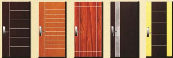
York Yale Windsor Oxford Kent